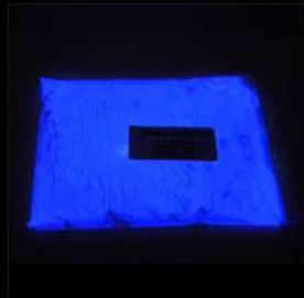
Bleu Low Luminance Solvent or Waterbased