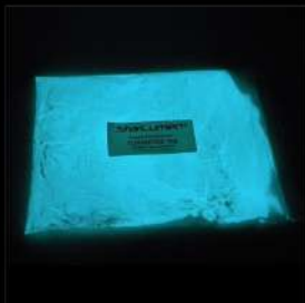
Turquoise (Blue-Green) Good luminance Solvent or waterbased