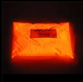
Red Short Luminance Solvent only