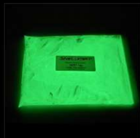
Vert High luminance Solvent or Waterbased All particle sizes

Definition: The name phosphorescent covers in general all types of pigments that emit light thanks to a luminous excitement. We will then talk about phosphorescent pigments to be more precise.