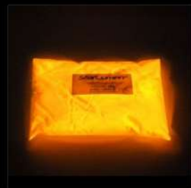
Orange Low Luminance Solvent only