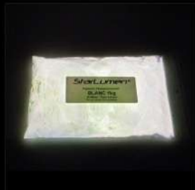
White Low Luminance Solvent only